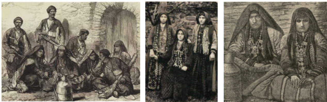
Fig. 1. Tushetian clothing: a – from an old photograph; b – from British magazine «The Illustrated London News» 22/10/1873; c – from French-language magazine «Le Coucase Illustre» 1899-90 № 3

The inhabitants of Tusheti, especially women, have been skilled in processing sheep's wool, felting it and knitting wool since ancient times. Several types of wool (the so-called «toli») were produced by domestic industrial method to make clothing. Even after the mass introduction of factory-made products, this tradition was preserved until the 1940s, and the most of the population continued to use products produced in family conditions.