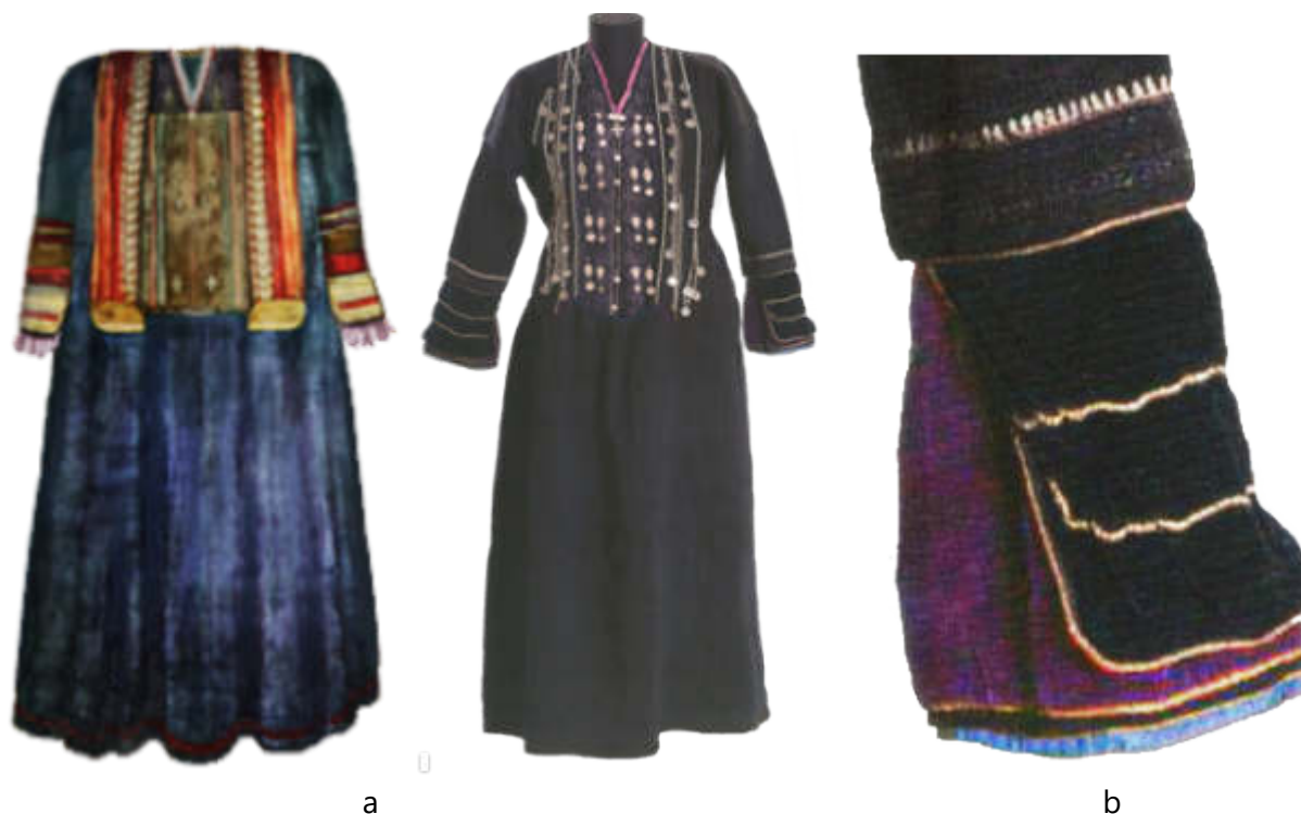
Fig. 2. a – type of juba; b – juba's cuffs

wrist, a kind of replaceable element – the so-called «sakhelkuro». It is obtained by connecting different colored (mostly black, blue or dark burgundy) velvet or woolen cloth, several cuff-like details, and can be decorated with colorful appliqués, embroidered broken ornaments, gold and silk twine threads, pleated borders, laces,