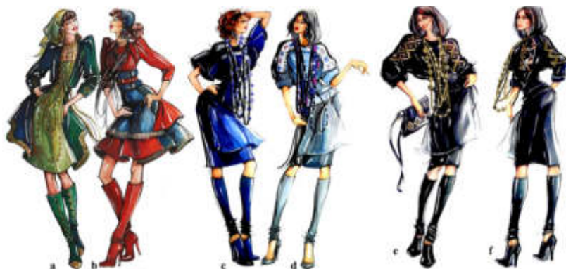
Fig. 5. Modern youth sets with elements of a Tushetian ethno-costume (Author L. Kiknavelidze, 2022)

The youth set – model 3 (Fig. 5, c), is a composition inspired by the decoration of Tushetian clothing, belt and apron; Here, the horizontal stripes of the skirt are the inspiration for the jubilee's vertically arranged saulis of the juba. The model is accented with the traditional blue color and the rectangular shape, typical of juba. The youth set – model 4 (Fig. 5, d) is also an interesting composition obtained by combining