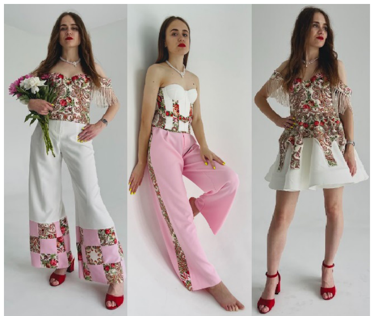
Fig. 3. Fragment of the collection "Symphony of Cultures" (Shybovska Ya., 2023)

re-manufacturing, restoration, and combining various materials. Restoring and transforming clothing help conserve valuable resources and extend its use. Recycling methods involve disassembling products into components that can be used to create new items. Upcycling as a recycling method includes creating new items by combining different textile materials. Old items can be turned into patchwork products or decorative elements. Combining materials allows for unique textural and visual effects. For the created collection, the main fabric chosen was "Barbie" suiting in two colors: milk-white and pink. The Ukrainian scarf was used as a decorative material to create interesting decorative and constructive elements.