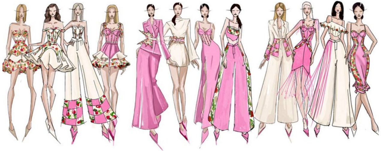
Fig. 2. Preliminary sketches of the collection "Symphony of Cultures" (Shybovska Ya., 2023)

re-manufacturing, restoration, and combining various materials. Restoring and transforming clothing help conserve valuable resources and extend its use. Recycling methods involve disassembling products into components that can be used to create new items. Upcycling as a recycling method includes creating new items by combining different textile materials. Old items can be turned into patchwork products or decorative elements. Combining materials allows for unique textural and visual effects. For the created collection, the main fabric chosen was "Barbie" suiting in two colors: milk-white and pink. The Ukrainian scarf was used as a decorative material to create interesting decorative and constructive elements.